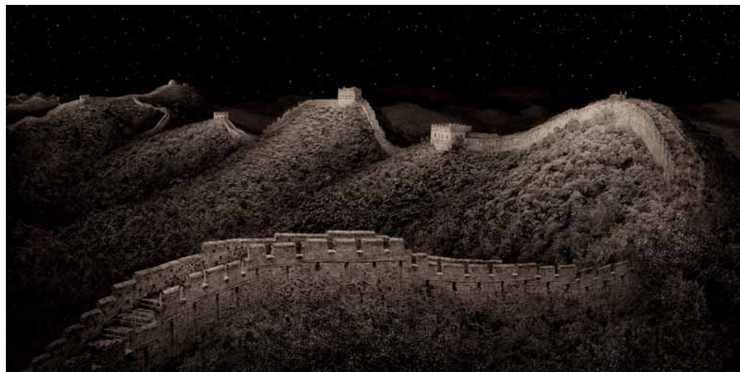
11 Great Wall , 2011 Photographic print on rag paper 100 × 200 cm (39 3 / 8 × 78 3 / 4 " )