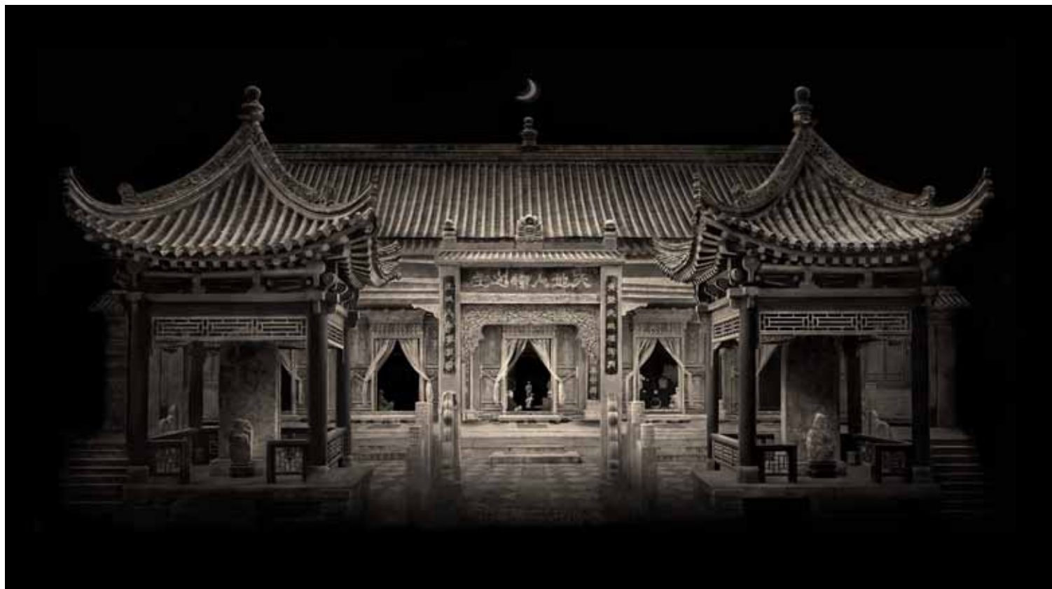
10 Mosque Xian , 2011 Photographic print on rag paper 100 × 180 cm (39 3 / 8 × 70 7 / 8 " )