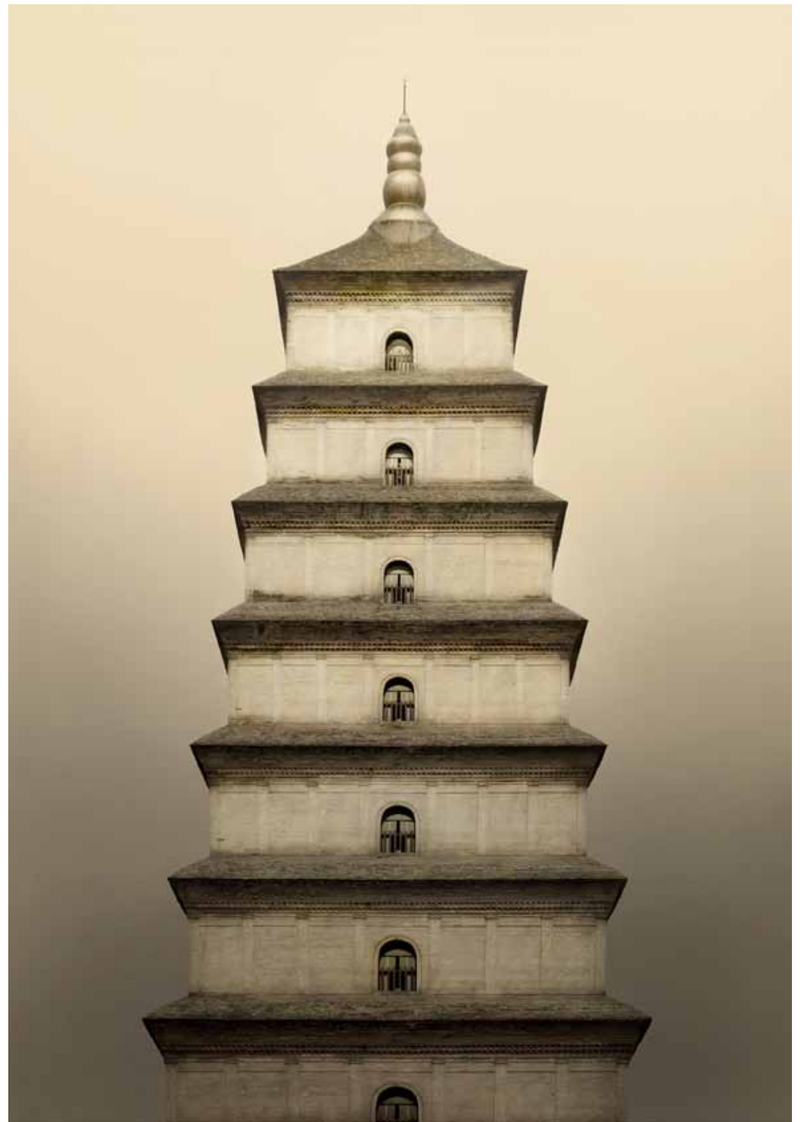
7 Goose Tower , 2011 Photographic print on rag paper 57 × 40cm (22 3 / 8 × 15 3 / 4 " )