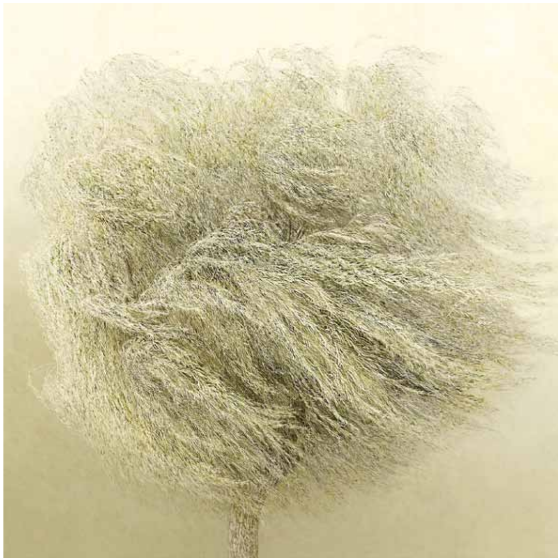
8 Salice Suzhou , 2011 Photographic print on rag paper 40 × 40cm (15¾ × 15¾")