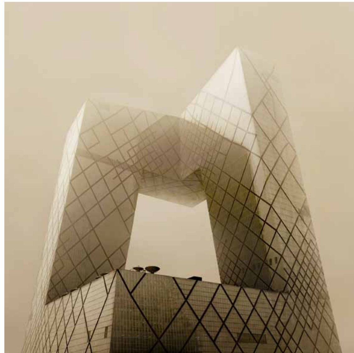
5 CCTV Building , 2011 Photographic print on rag paper 40 × 40cm (15¾ × 15¾")