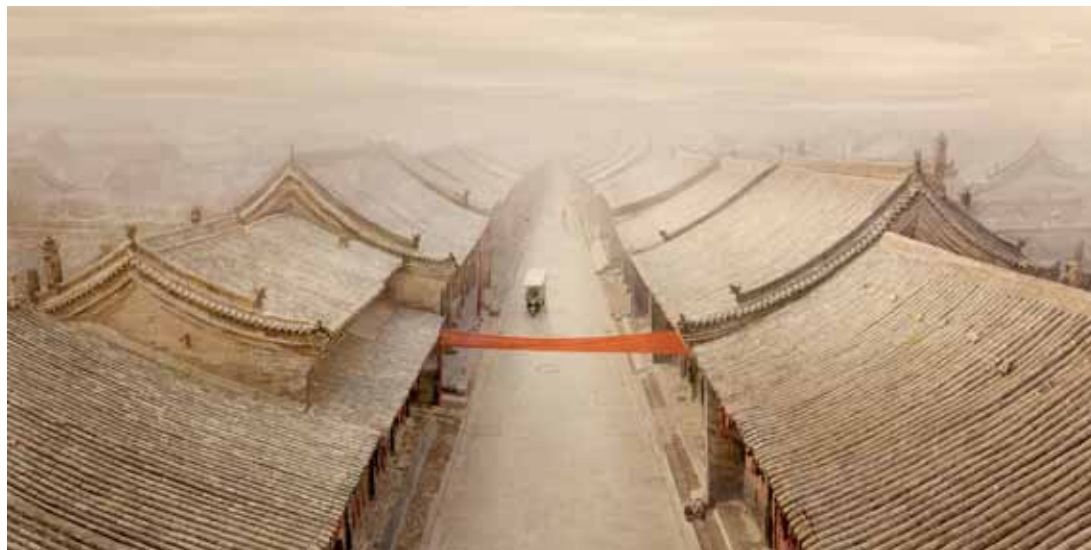
13 Forbidden City , 2011 Photographic print on rag paper 40 × 80 cm (15¾ × 31½")