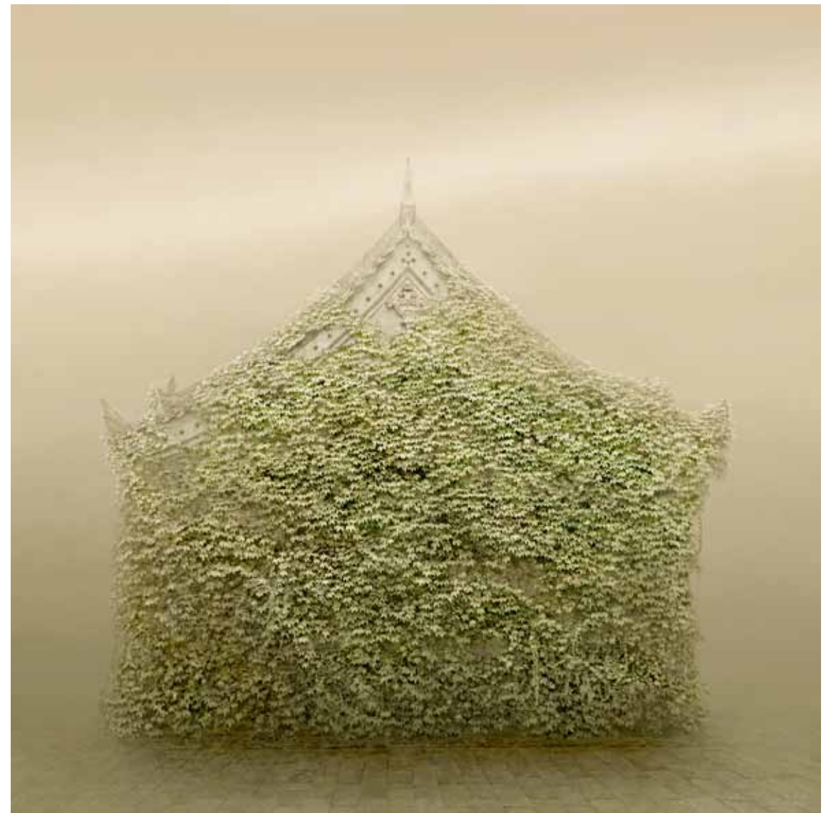
9 Pagoda , 2011 Photographic print on rag paper 40 × 40cm (15¾ × 15¾")