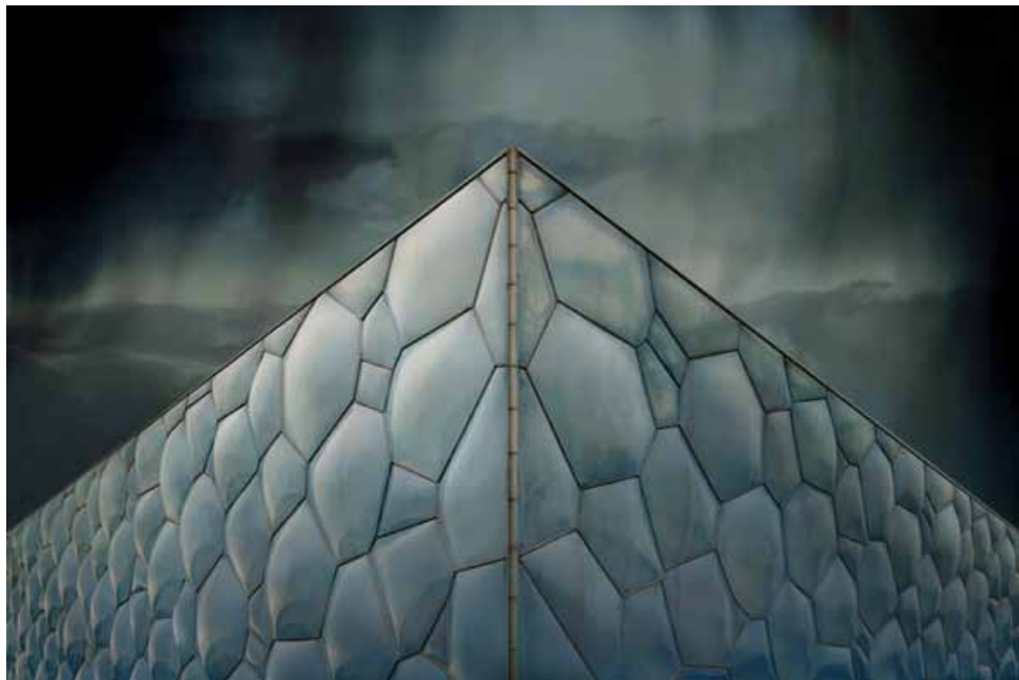
4 Watercube, Beijing , 2011 Photographic print on rag paper 40 × 60cm (15¾ × 23⅝")