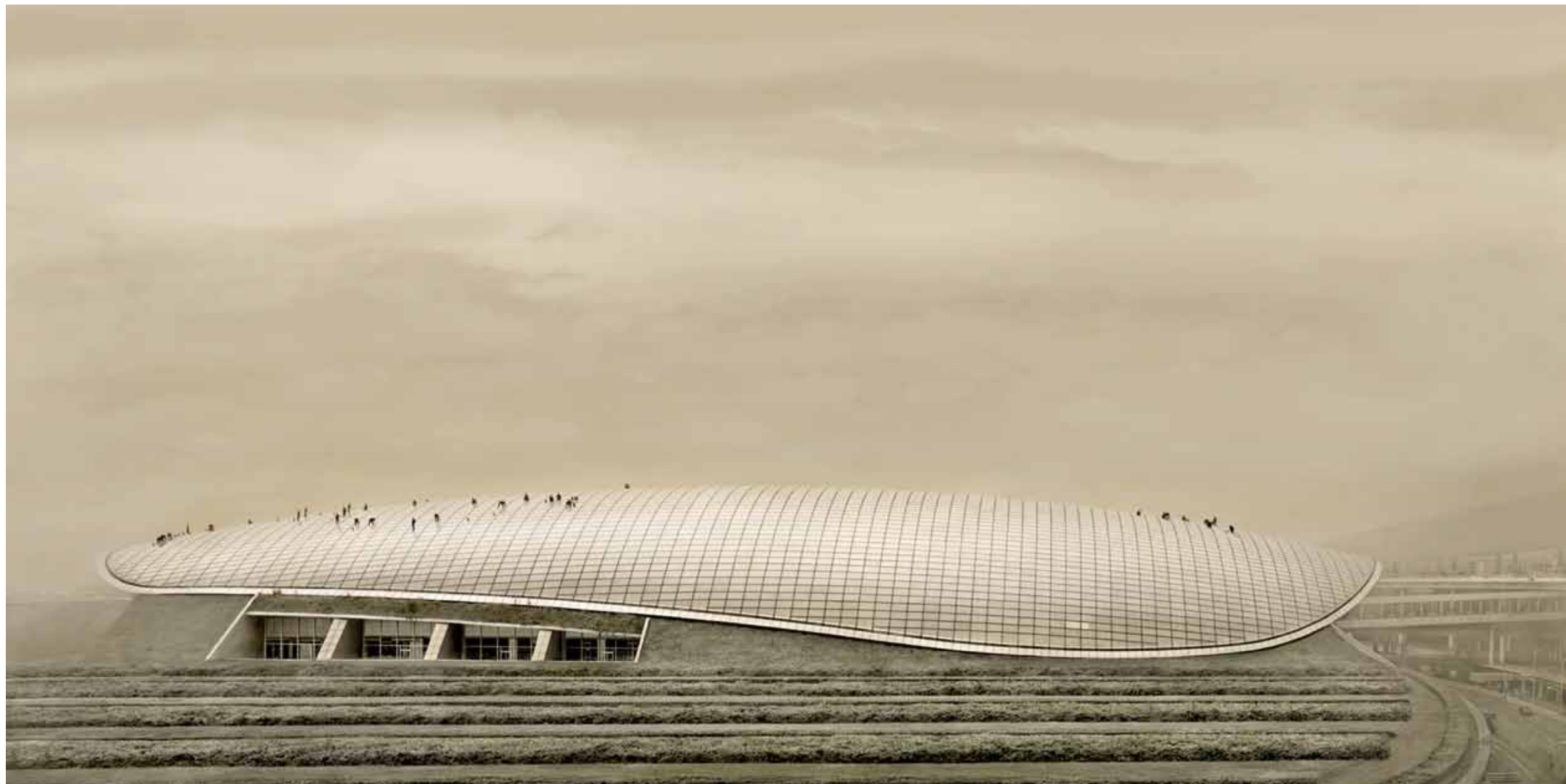
6 Beijing Airport , 2011 Photographic print on rag paper 100 × 200cm (39 3 / 16 × 78 3 / 4 " )