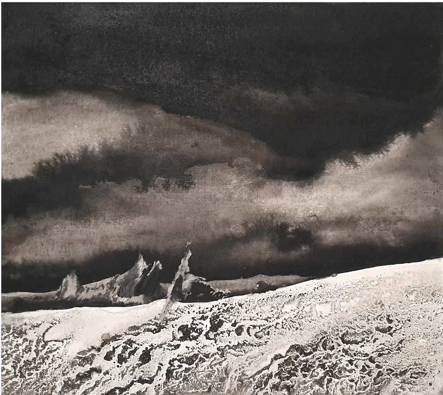
PROCESSION LEAD BY SAINT MICHAEL, 2019

Ink and mixed media on canvas 104.5 x 104.5 cm (41½ x 41½ in)