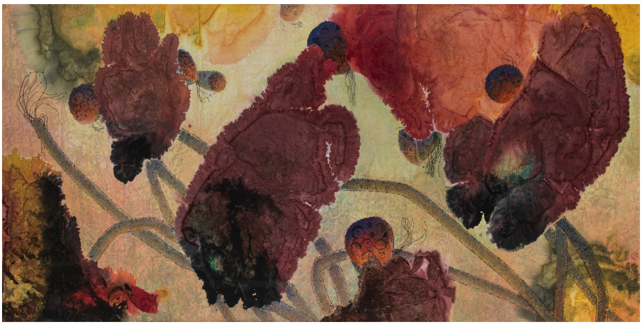
Autumn Song, 1996 by Yang Yanping (b.1934).

her to embrace modernism without jettisoning the lessons from the classical Chinese world of high culture. Estimate: £6,000-8,000.